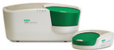
Bio-Rad’s QX100 droplet digital PCR System.