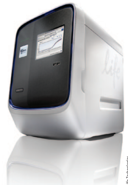
Life Technologies’ QuantStudio System for digital PCR and qPCR.

we found is that a lot of our customers want the capability [for digital PCR] but aren’t ready to jump in and say that that’s the only thing that they have to do,” says Pickering. Buying a machine that can do both, he says, is similar to the decision to purchase a hybrid gas and electric automobile rather than an electric-only vehicle.