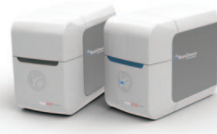
RainDrop Source and RainDrop Sense machines for droplet digital PCR.

Another digital PCR system has been developed by RainDance and is scheduled to launch later this year. The machines in